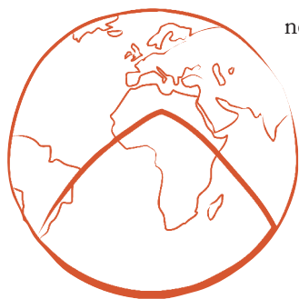
Left Spherical geometry and the curvature of the Earth.

ness” is not immediately obvious. Suppose, however, that you were unable to perceive a third dimension beyond the surface of the sphere. For example, perhaps you are an ant, living on the surface of an asteroid with no oceans (so you can go anywhere you want to). You have no concept of space, no concept of underground;